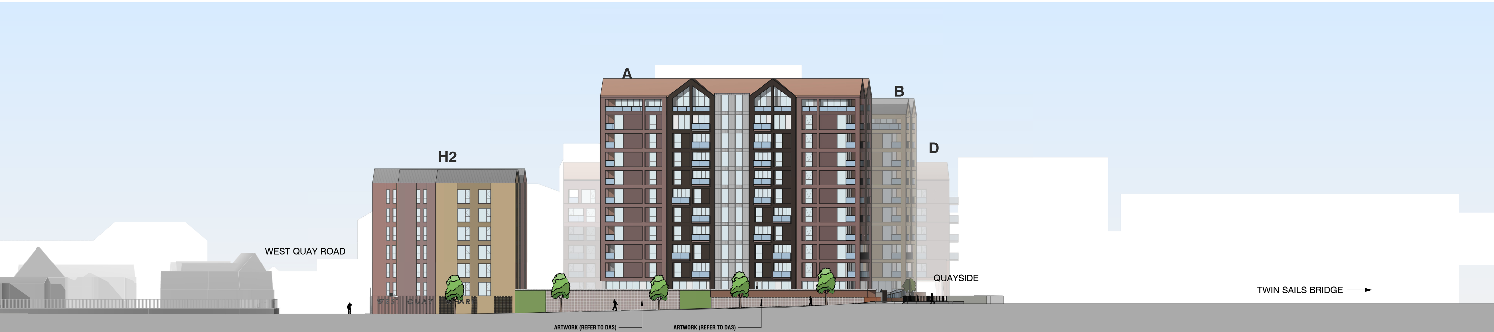
North Elevation 1 : 350